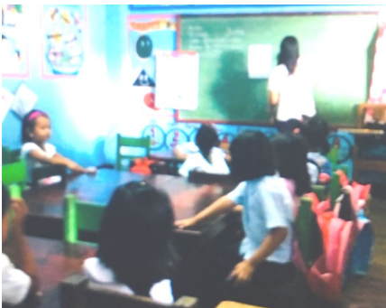
Above: San Nicolas Early Childhood classroom

At left: the Senior Nutrition and Wellness Program in action